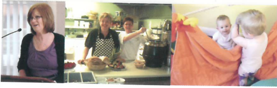
6 Footprints Trading Ltd